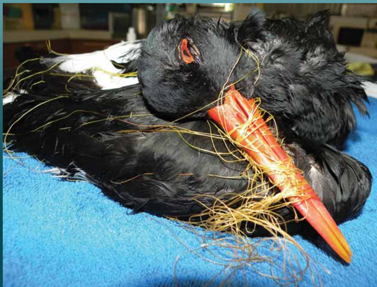
The critically endangered pied oystercatcher—a tragic victim of discarded fishing line.