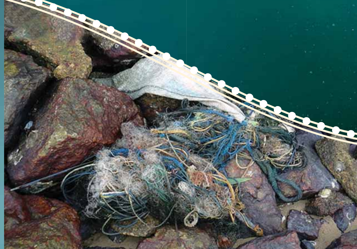
It doesn't just disappear.