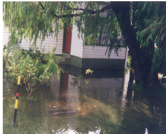
Photograph B10: Flooding outside 61 Tasman Street