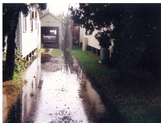
Photograph B6: Flooding in front of 61 Tasman Street (left)