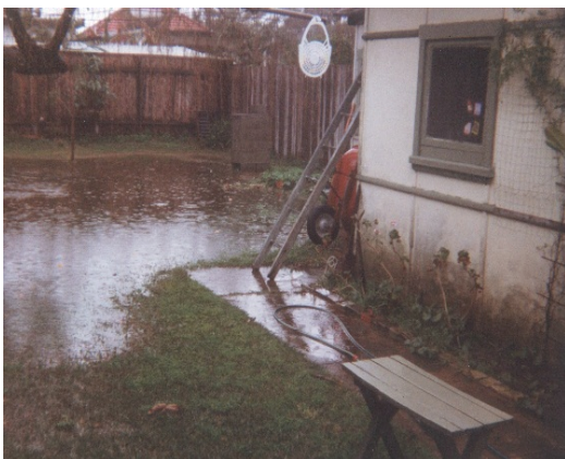
Photograph B11: Flooding in the Backyard of 61 Tasman Street