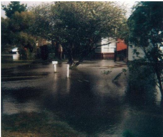
Photograph B9: Flooding in front of 61 Tasman Street