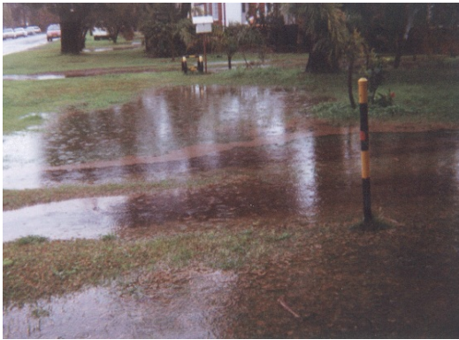
Photograph B7: Flooding in front of 61 Tasman Street