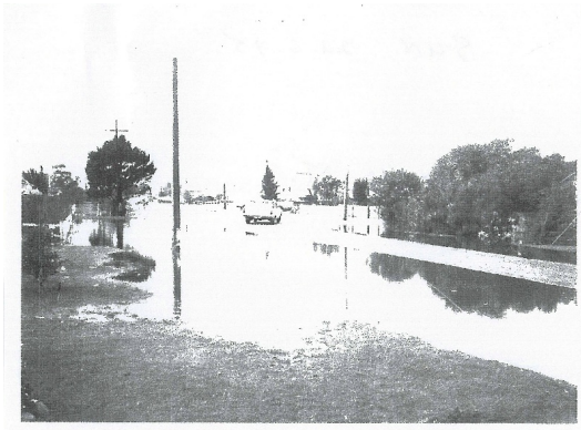
Photograph B1: Flooded Street