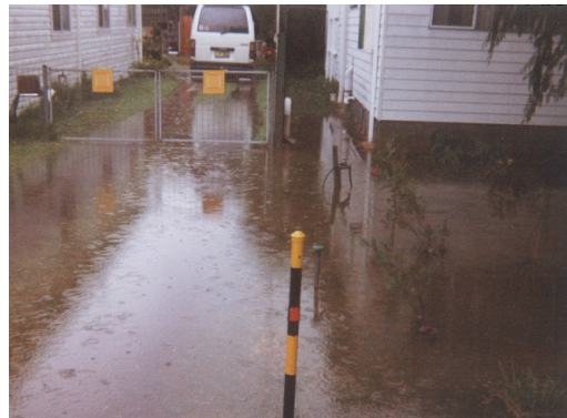
Photograph B4: Flooding in front of 63 (left) and 61 (right) Tasman Street