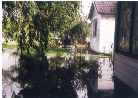
Photograph B8: Flooding in front of 61 Tasman Street