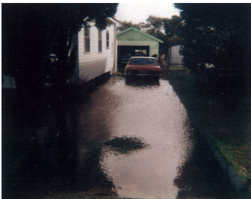
Photograph B5: Additional Flooding in front of 61 Tasman Street (left)