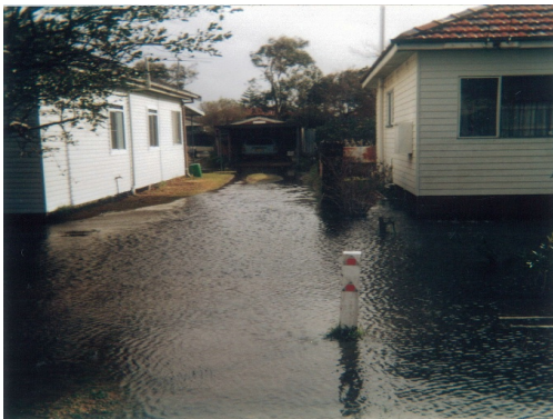
Photograph B3: Flooding in front of 63 (left) and 61 (right) Tasman Street in front of 63 (left) and 61 (right) Tasman Street