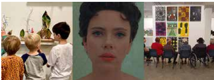
Image (central): Still from Asteroid City , Wes Anderson, Universal Pictures International 2023.

We invite people living with dementia and their carers to Art Engage. Our program engages participants with their world and sense of identity through art and provides opportunities for connection through conversation, artmaking and looking at art. Bookings essential.