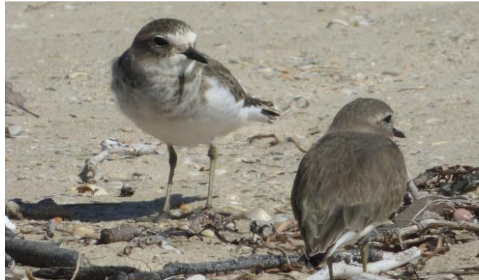
Double-banded plover winter sprinter

A migration so long over its lifetime it is equal to flying to the moon. Travels to the breeding grounds via the Yellow Sea in China and then flies further north to Alaska. After breeding it then travels non-stop back via the Pacific Ocean, the longest non-stop migration known. Can be seen resting or feeding with the eastern curlews. This bird is smaller than the curlew and its bill curves slightly up rather than down.