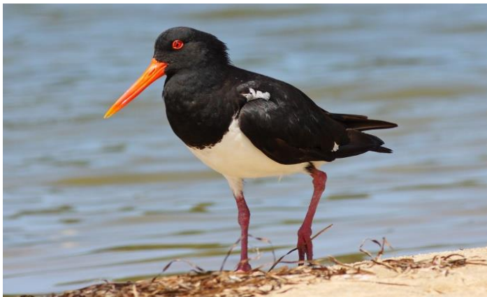
Pied oystercatcher - ENDANGERED seafood specialist

Rope lines/signs will indicate nesting in progress. The fence is the most important element to protect the eggs, but it has a limited effect. To hatch chicks on a busy beach it can take 10 years of trial and error to overcome all the threats. There are only two nesting attempts a year. It takes only 20 minutes for an unattended egg or chick to die and every disturbance adds up. Estimates show fewer than 200 breeding pairs left in NSW.