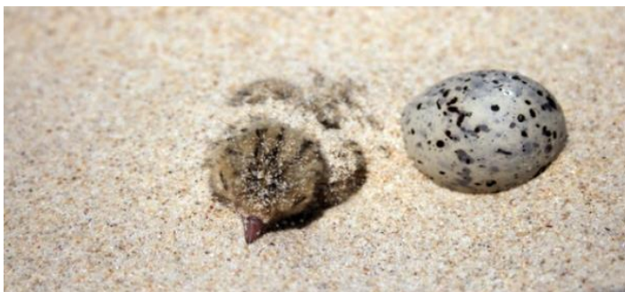
When eggs/chicks are left exposed; even a light sea breeze could bury them if the parents are scared off nest too often.

As with most Sydney beaches, dogs are not allowed on the Maianbar beach areas, the foreshore reserves or sandflats at any time. Nesting birds will be disturbed much earlier and stay off nest at just the presence of a dog, big or small, on or off-lead. Birds will move off nest before you see them. By the time you see them the eggs/chicks are unprotected.