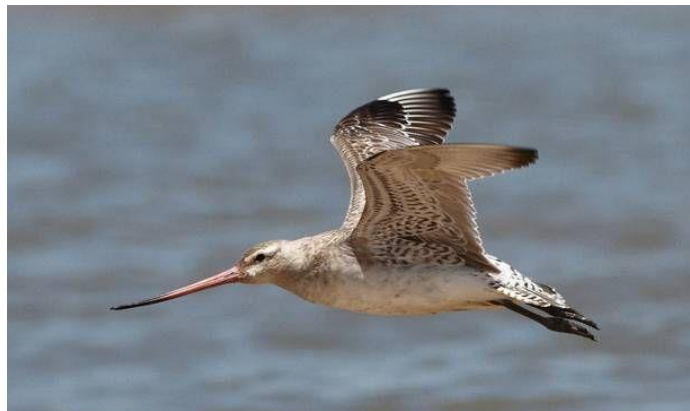
Bar-tailed godwit - VULNERABLE marathon winner

Travelling about 10,000 kilometres from and to Arctic breeding grounds it is the world's largest migratory wader and has a downward curved bill. Numbers have crashed by 80% in just 3 decades. They are very wary birds and easily disturbed. If you see them ahead, walk around them allowing 100 metres of space. They are on the beach at high tide and on the tidal flats at low tide.