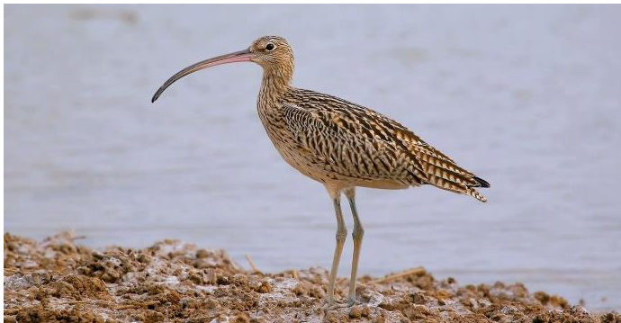
Eastern curlew – CRITICALLY ENDANGERED summer stunner

Rope lines/signs will indicate nesting in progress. The fence is the most important element to protect the eggs, but it has a limited effect. To hatch chicks on a busy beach it can take 10 years of trial and error to overcome all the threats. There are only two nesting attempts a year. It takes only 20 minutes for an unattended egg or chick to die and every disturbance adds up. Estimates show fewer than 200 breeding pairs left in NSW.