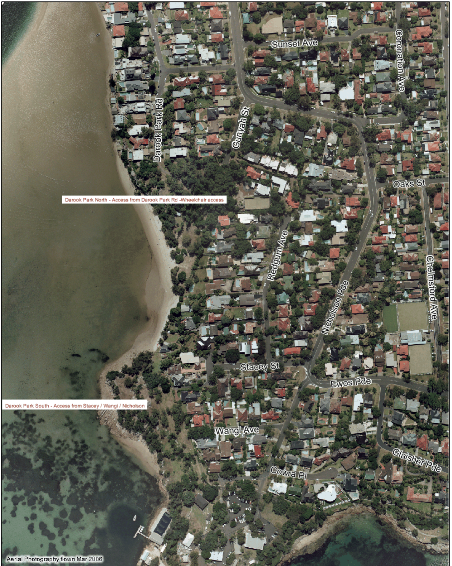
Aerial Photography flown Mar 2006