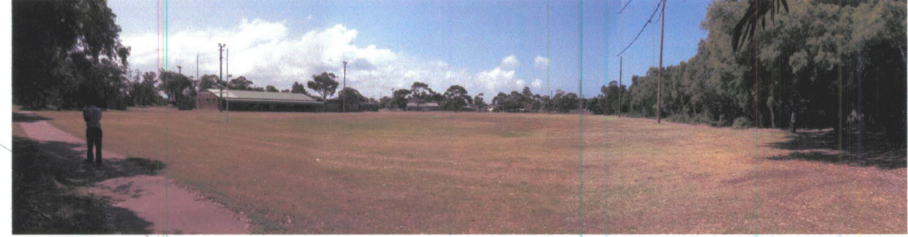
VIEW NORTH OVER PLAYING FIELD

SUTHERLAND SHIRE COUNCIL INVITES THE COMMUNITY TO PROVIDE COMMENTS WITH REGARDS TO THE MARTON PARK LANDSCAPE CONCEPT PLAN. IT IS INTENDED THAT THIS PLAN WILL FORM THE BASIS FOR FUTURE WORK IN THE RESERVE. COMMENTS SHOULD BE FORWARDED TO COUNCIL'S PARKS AND WATERWAYS BRANCH BY WEDNESDAY 12TH DECEMBER 2007 FOR FURTHER INFORMATION PLEASE CONTACT: SUTHERLAND SHIRE COUNCIL PARKS AND WATERWAYS BRANCH LOCKED BAG 17 SUTHERLAND NSW 1499 PH: 9710 0333 FAX: 9710 0397