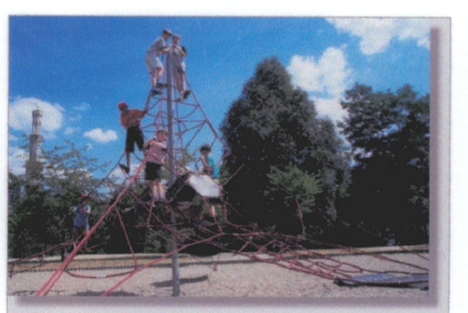
POSSIBLE PLAY EQUIPMENT OPTIONS

This plan will form the basis for future work in the reserve at Old Princes Highway cnr Geebung Lane, Engadine. Comments are invited until Monday, 10 June 2007. For further information: Sutherland Shire Council Parks and Waterways Branch Locked Bag 17 PH: 9710 0333 Sutherland NSW 1499 FAX: 9710 0397