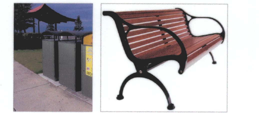
POSSIBLE PARK FURNITURE OPTIONS TO MATCH SHOPPING CENTRE

This plan will form the basis for future work in the reserve at Old Princes Highway cnr Geebung Lane, Engadine. Comments are invited until Monday, 10 June 2007. For further information: Sutherland Shire Council Parks and Waterways Branch Locked Bag 17 PH: 9710 0333 Sutherland NSW 1499 FAX: 9710 0397