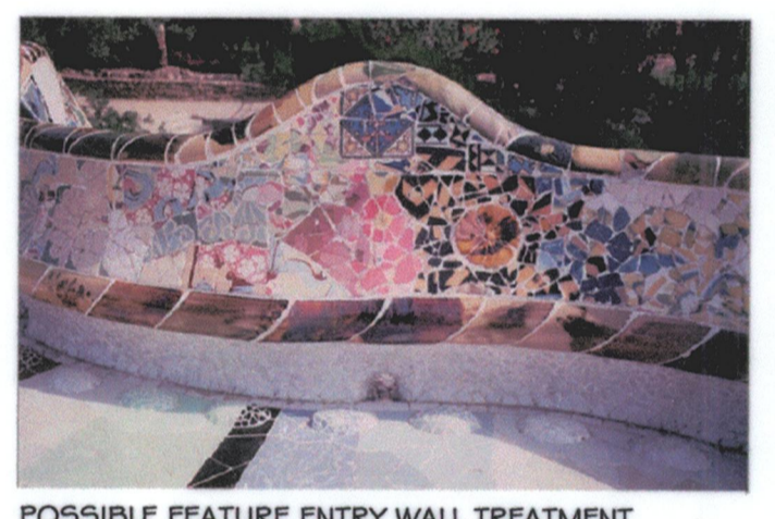
POSSIBLE FEATURE ENTRY WALL TREATMENT