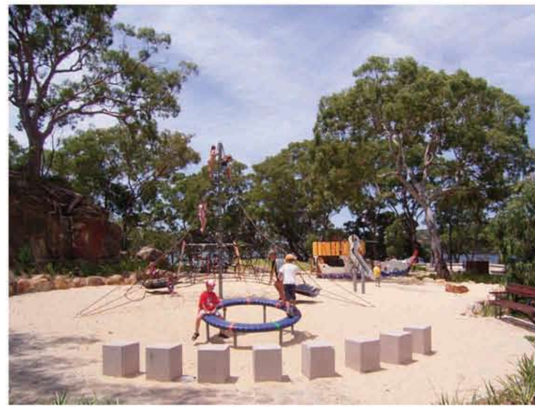
INDICATIVE PLAYGROUNDS - COMO PLEASURE GROUNDS