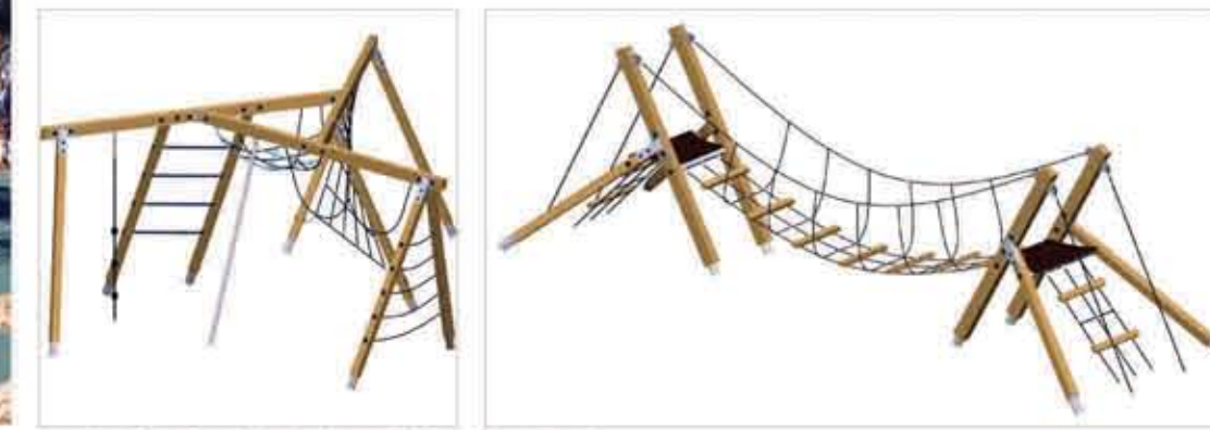
INDICATIVE PLAY EQUIPMENT