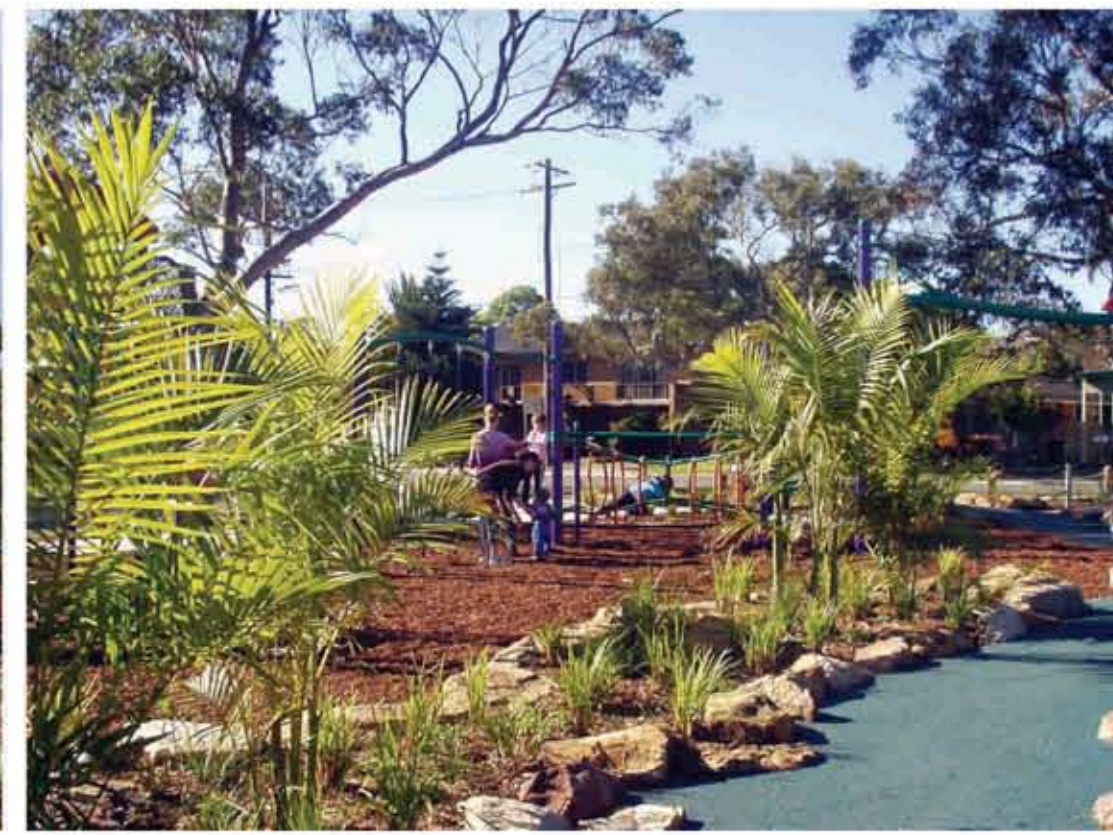
FERNTREE ROAD RESERVE