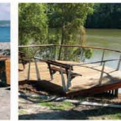
INDICATIVE BARRIERS, AMPHITHEATRE & DECK