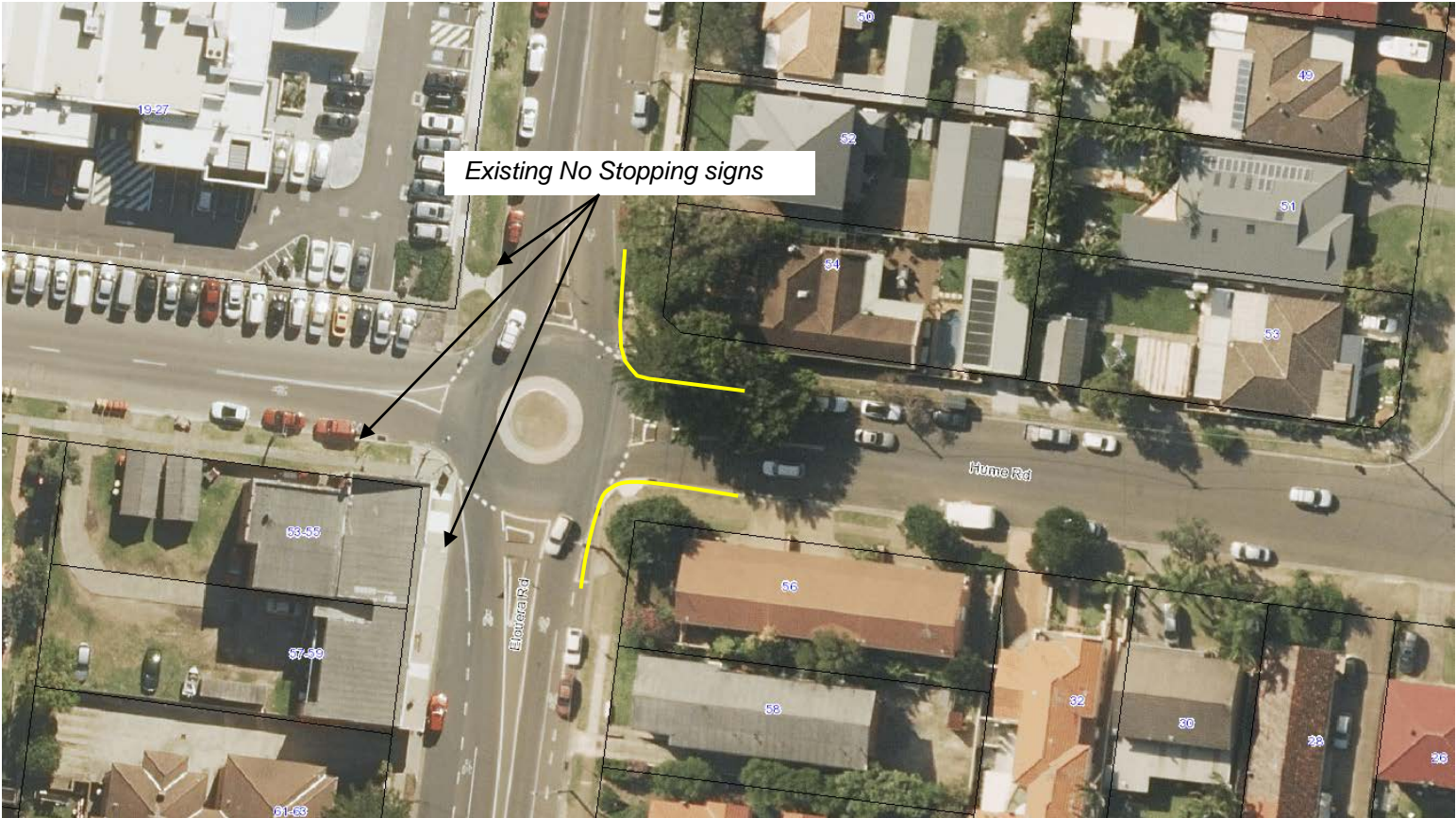
Linemark yellow No Stopping lines along south-eastern and north-eastern kerbs at corner of Hume Rd & Elouera Rd as shown