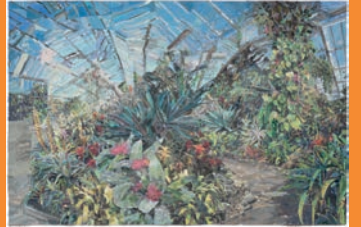
Leah Bullen, Memory Theatre , 2018, watercolour, gouache and monotype on paper, 83.5 x 126 cm.

Enjoy a morning sketching in Hazelhurst gardens and then use this as source material to make monotypes, described as painterly prints, in the studio. You will learn how to prepare a plate, build up an image and print through the press.