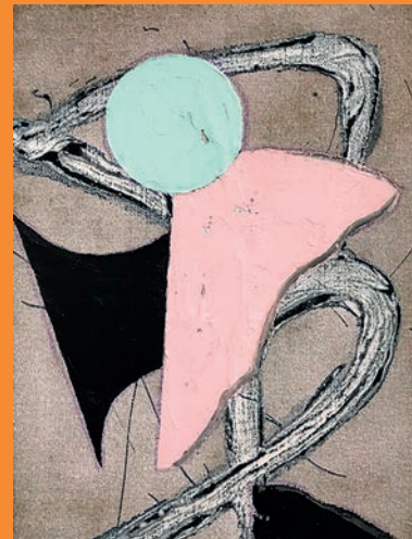
Peter Sharp Proposition for a tree study 2 , 46 by 35cm, oil and acrylic on linen board.