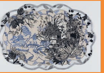
Christine Drutt-Preston Olley Land - A lover's tale 2018, lino block and embroidery on vintage domestic textile.

Expand the boundaries of your artmaking practice by combining print with both traditional and non-traditional artmaking mediums to make artworks on paper.