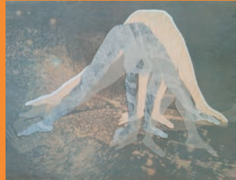
Brenda Tye Untitled , monotype with stencilling.

This printmaking workshop utilises the processes of monoprinting, stencilling and dry point to create a series of prints to help you visually communicate, develop and extend your concepts. Learn the basics of how to make a monoprint, how to utilise a stencil for its textural properties or as a tool that extends the visual image and the many ways to use line through dry point.