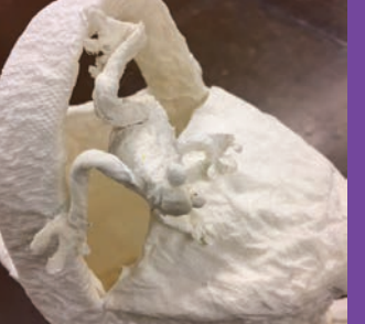
Lorraine Holley, The Garden Shed (detail) 2018