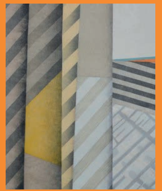
Roslyn Kean Defining Edges creating Shapes - Venice , detail, 2018, wood cut print.

Based on the tradition of ancient Japanese woodblock printing, you will print using two inking techniques: by hand with baren using traditional pigment, then combining with relief printing techniques are non-toxic and all cleaning is done with water. Learn the printing process with an emphasis on technique.