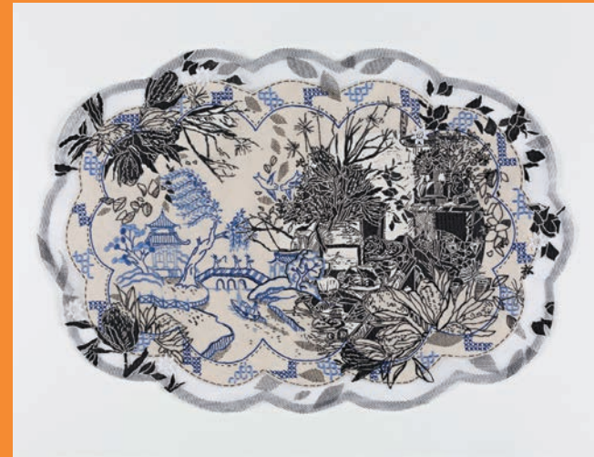
Christine Drutt-Preston Olley Land, A lover's tale 2019, lino block and embroidery on vintage domestic textile