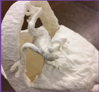
Lorraine Holley, The Garden Shed (detail) 2018