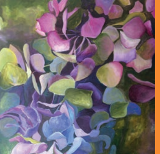
Tracey Miller Hydrangea , 2018, acrylic on canvas

Using photographs as reference, create large macro floral paintings on canvas that explore the dynamic impact of scale. With a focus on composition, colour and contrast you will achieve a stand out, three dimensional work. Tracey will guide you to express yourself, building confidence through your art making.