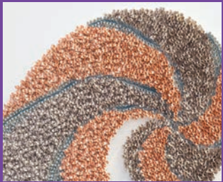
Credit: Lisa Duncan, Sea Scrolls , 2017, cut and rolled paper, marker pen

Thur 6.30pm to 9.30pm Tutor Lee Bethel CODE HAZ037 Fee $280 + $25 materials STUDIO 6