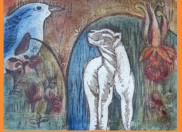
Seraphina Martin Adoration , 2013, aluminium etching

Become inspired by the prints of David Hockney and create etchings with an emphasis on drawing. Produce a stunning portfolio of eight to ten colourful prints in just two days using aluminium plates etched in copper sulphate. Like traditional etching, this innovative process involves intaglio techniques such as hard ground and soft ground using textures from found objects.