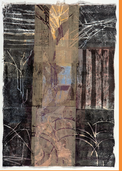
Gary Shinfield Window , unique state, woodblock print , 76 x 56 cm, 2016

Fee: $240, includes a materials fee Suitable for intermediate to advanced