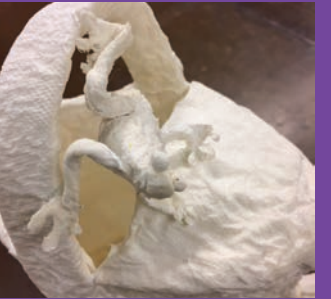
Lorraine Holley, The Garden Shed (detail) 2018