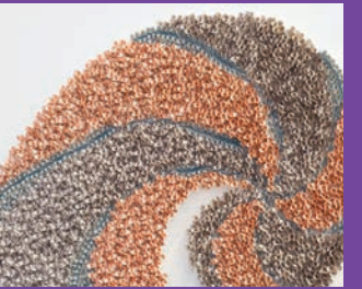
Credit: Lisa Duncan, Sea Scrolls , 2017, cut and rolled paper, marker pen

Thur 6.30pm to 9.30pm Tutor Lee Bethel CODE HAZ037 Fee $275 + $25 materials STUDIO 6