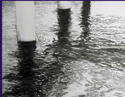
Fiona McFadyen, Under the boardwalk , 2009

Art rules – HSC Artwork 10 December '11 – 15 January '12