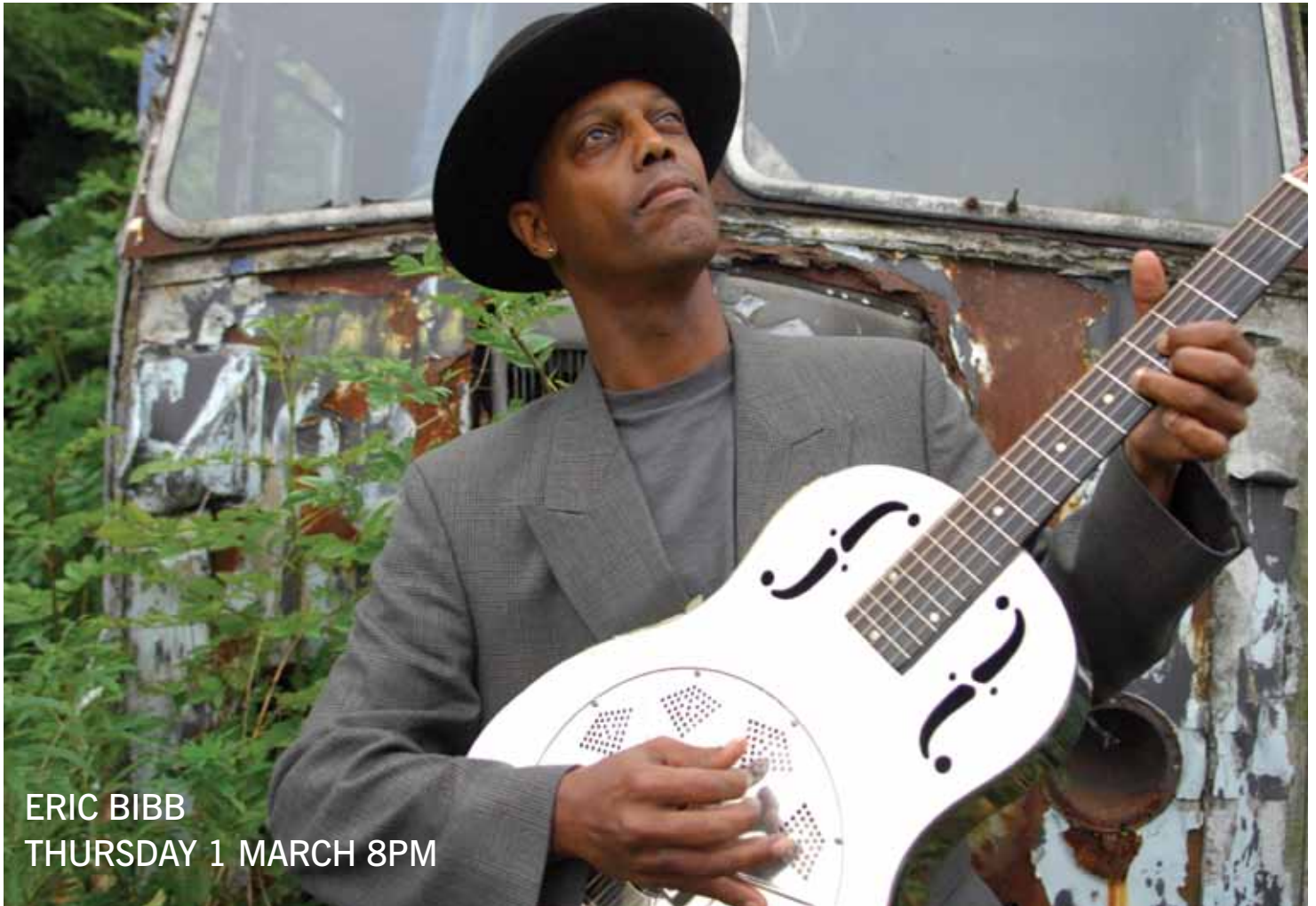
ERIC BIBB THURSDAY 1 MARCH 8PM

What's on at the Sutherland Entertainment Centre