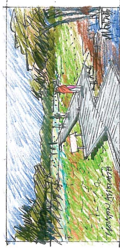
Boardwalks protecting sensitive salt marshes