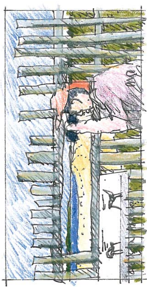
Bird hides adjoining Quibray Bay