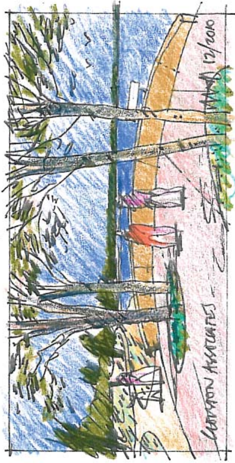
Meeting place near car park